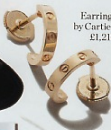
Earrings by Cartier, £1,210