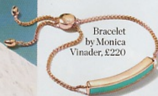
Bracelet by Monica Vinader, £220