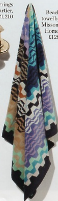
Beach towel by Missoni Home, £128