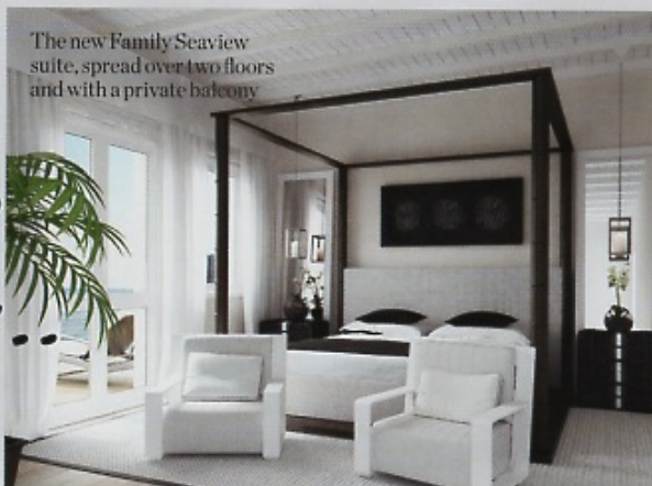
The new Family Seaview suite, spread over two floors and with a private balcony