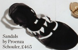
Sandals by Proenza Schouler, £465