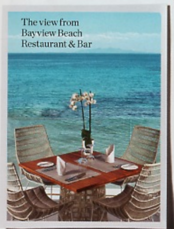
The view from Bayview Beach Restaurant & Bar