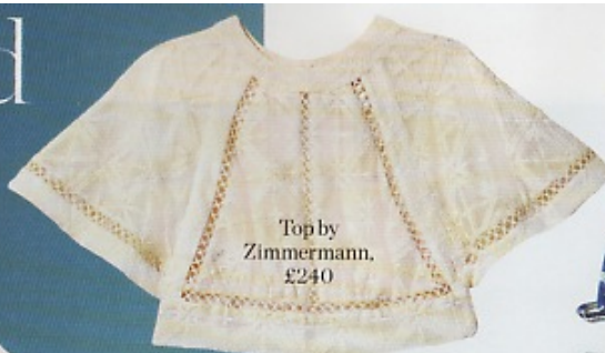
Top by Zimmermann, £240