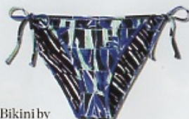
Bikini by Kenzo, £150